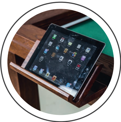
iPAD / TABLET HOLDER