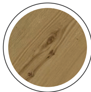
KNOTTY OAK 480 €