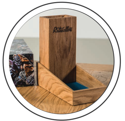
RAT TRAP DICE TOWER