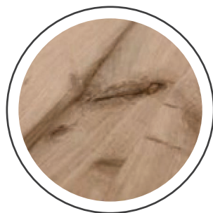
RUSTIC OAK 490 €