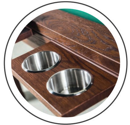
DOUBLE CUP HOLDER*