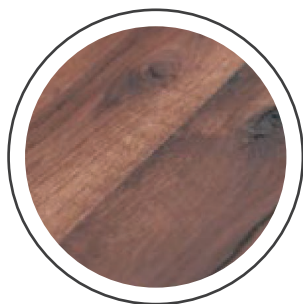
OAK ANTIQUE 570 €

Choose from our attractive charismatic surfaces such as Oak Antique, Rustic Oak, or Knotty Oak.