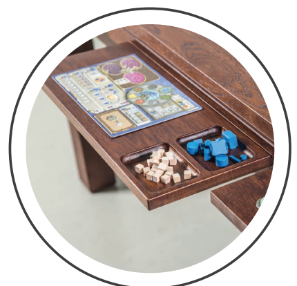
CARD & COUNTER HOLDER