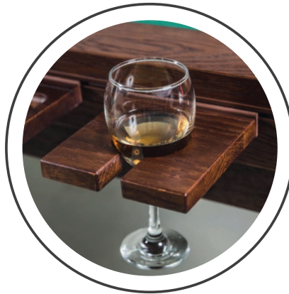
WINE GLASS HOLDER