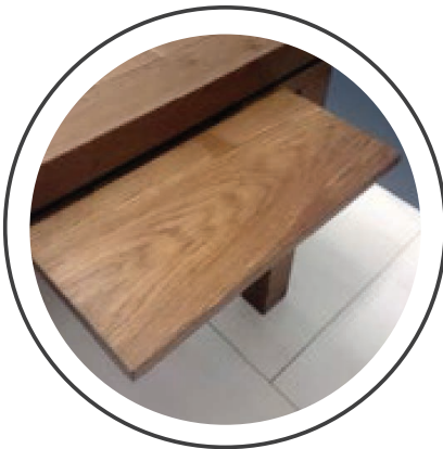
WORK & PLAY SHELF